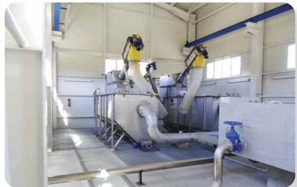
Dual Headworks Units