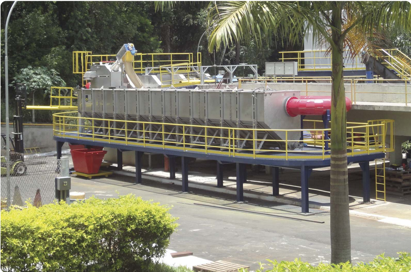
4.5 MGD WASTEMASTER™ Compact Plant