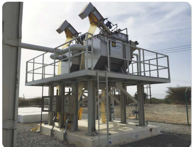
500 GPM SPECOCO Compact Plant