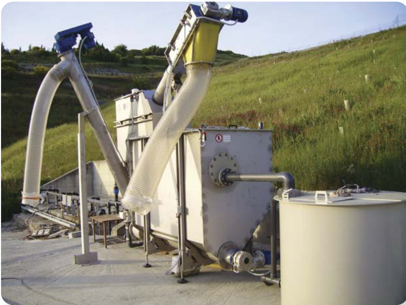
200 GPM SPECOCO Compact Plant

A Self-Contained Pre-Packaged Treatment Plant with Solids Screening, Grit Removal and Degreasing.